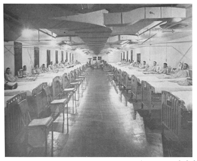
Fig. 1. Project "Strong Bones" volunteer subjects in secluded and blacked out open bay ward of Wilford Hall USAF Hospital.

The investigation was designed to include laboratory, physiological, and x-ray studies. Exact metabolic balance studies could not be accomplished because of limited capability in the collection, preparation, and analysis of the specimens for thirty subjects. The environment, diet, activity, and health of the participants were strictly controlled. All participants were secluded in an isolated open bay ward of the hospital in which ultraviolet light was blacked out (Fig. 1). The