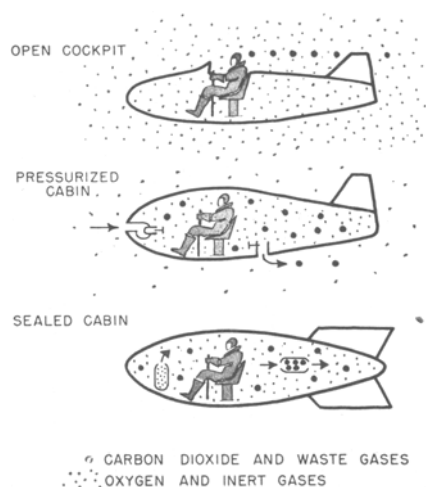
Fig. 1. Respiratory conditions existing in three types of cabins, showing supply of oxygen and elimination of carbon dioxide or waste gases. (The density of the spots simulates the concentration of molecules or the pressure.)

carbon dioxide, those based chiefly upon physical principles, would be most suitable. This is because they permit rapid continuous reading and