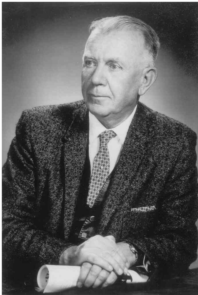
Fig. 2. Dr. Hubertus Strughold (1963).

Strughold named it the "Space Cabin Simulator" (16). It provided 100 cubic feet of space, just enough for an aircraft seat and an instrument panel. It had life support systems for closed loop cabin atmosphere maintenance and urine distillation pure enough to drink. Cabin pressure was maintained constantly at a level equivalent to an altitude of 18,000 to 25,000 ft (8).